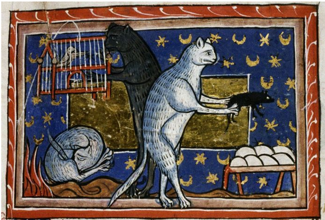
Bodleian Library, MS. Bodley 764, Folio 51r

Palm Prints is a publication of the Barony of Atenveldt a branch of the Society for Creative Anachronism, Inc. Palm Prints is not a corporate publication of the SCA, Inc. and does not delineate SCA policies. Copyright(c) 2015 Society for Creative Anachronism, Inc. For information on reprinting photographs, pictures, or articles from this publication, please contact the seneschal listed on the Baronial Officership page who will assist you in contacting the original creator of the piece. Palm Prints is available online at www.baronyofatenveldt.org or can be emailed. You may request a printed copy from the seneschal.